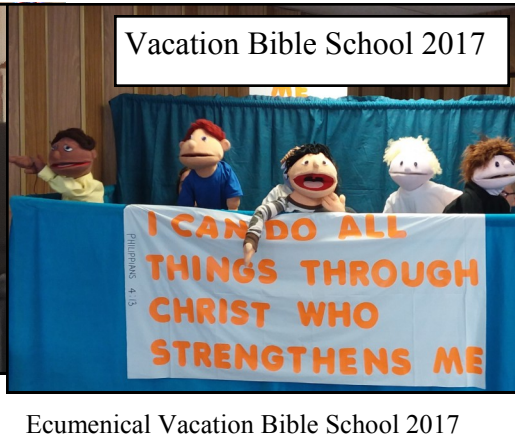
Ecumenical Vacation Bible School 2017